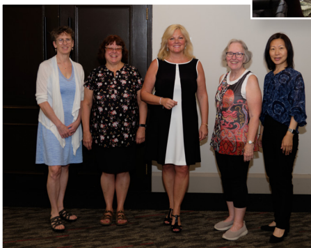
Manitoba - MRMTA