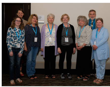
British Columbia - BCRMTA