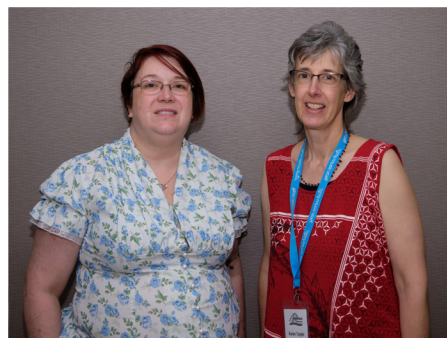
Nova Scotia - NSRMTA