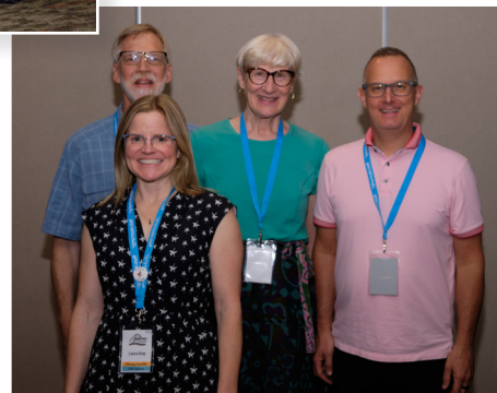
Ontario - ORMTA