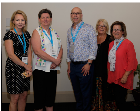
Saskatchewan - SRMTA