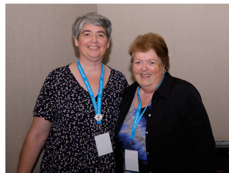
New Brunswick - APMNBRMTA