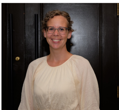
Prince Edward Island - PERMTA