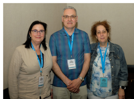
Quebec - APMQMTA