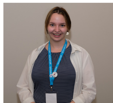
Yukon - YRMTA