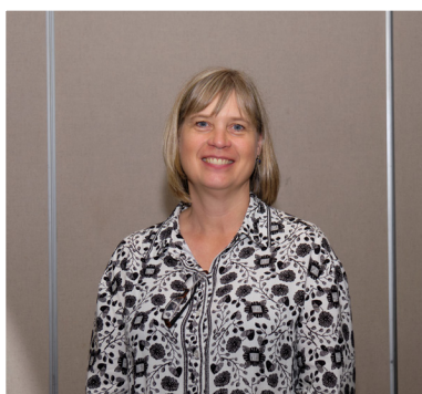
Northwest Territories - NTRMTA