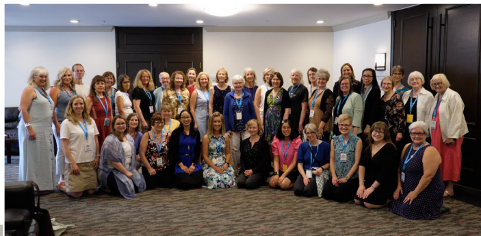
Hosting Province Alberta - ARMTA